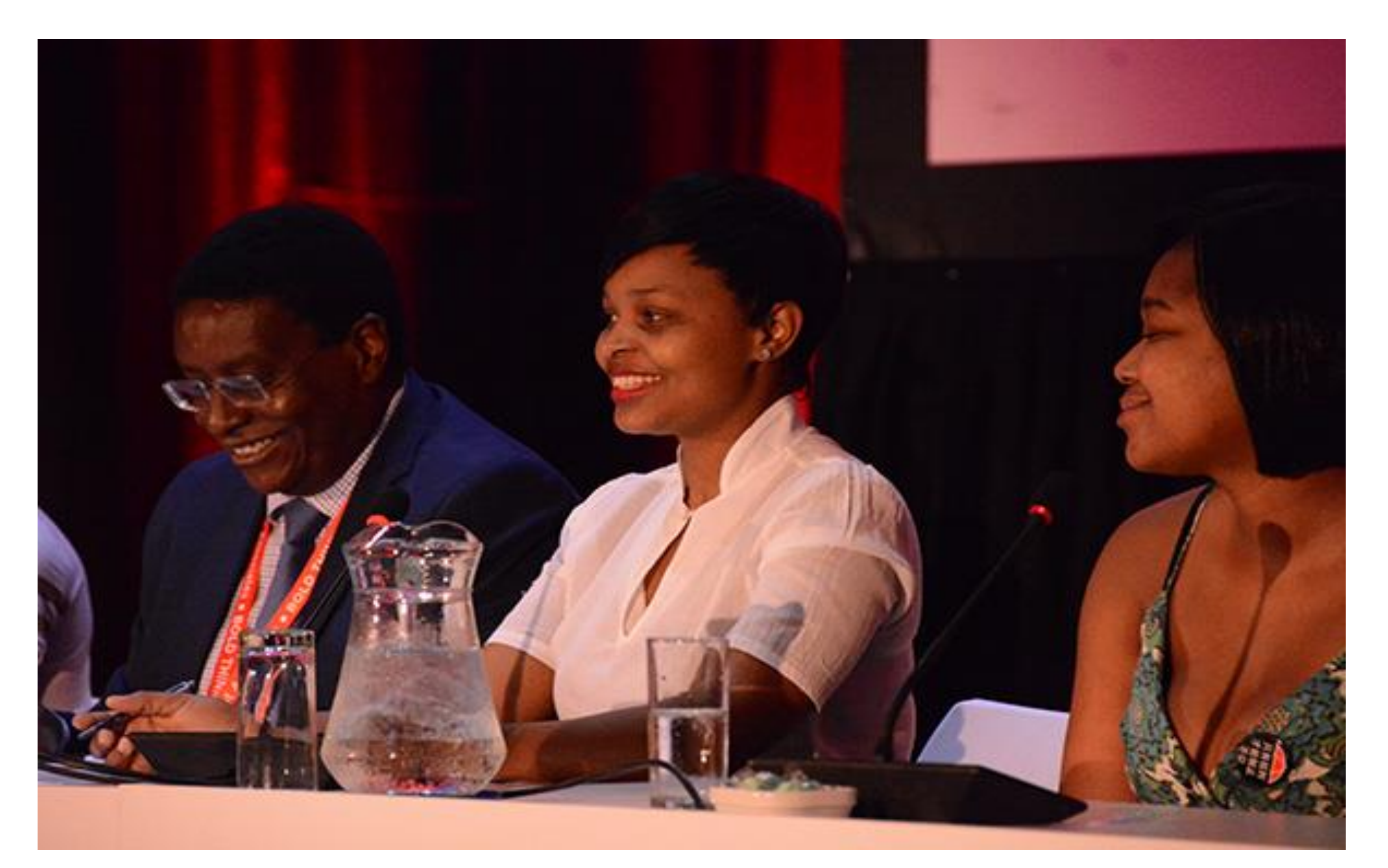
Fig 1:Trial participants from the dapivirine ring study share their experiences, Durban July2016.

Panel 2 highlighted experiences of young participants in the vaginal ring and oral PrEP demonstration studies, a user of oral PrEP in the private sector and young women who would be potential future users, followed by moderated discussion.