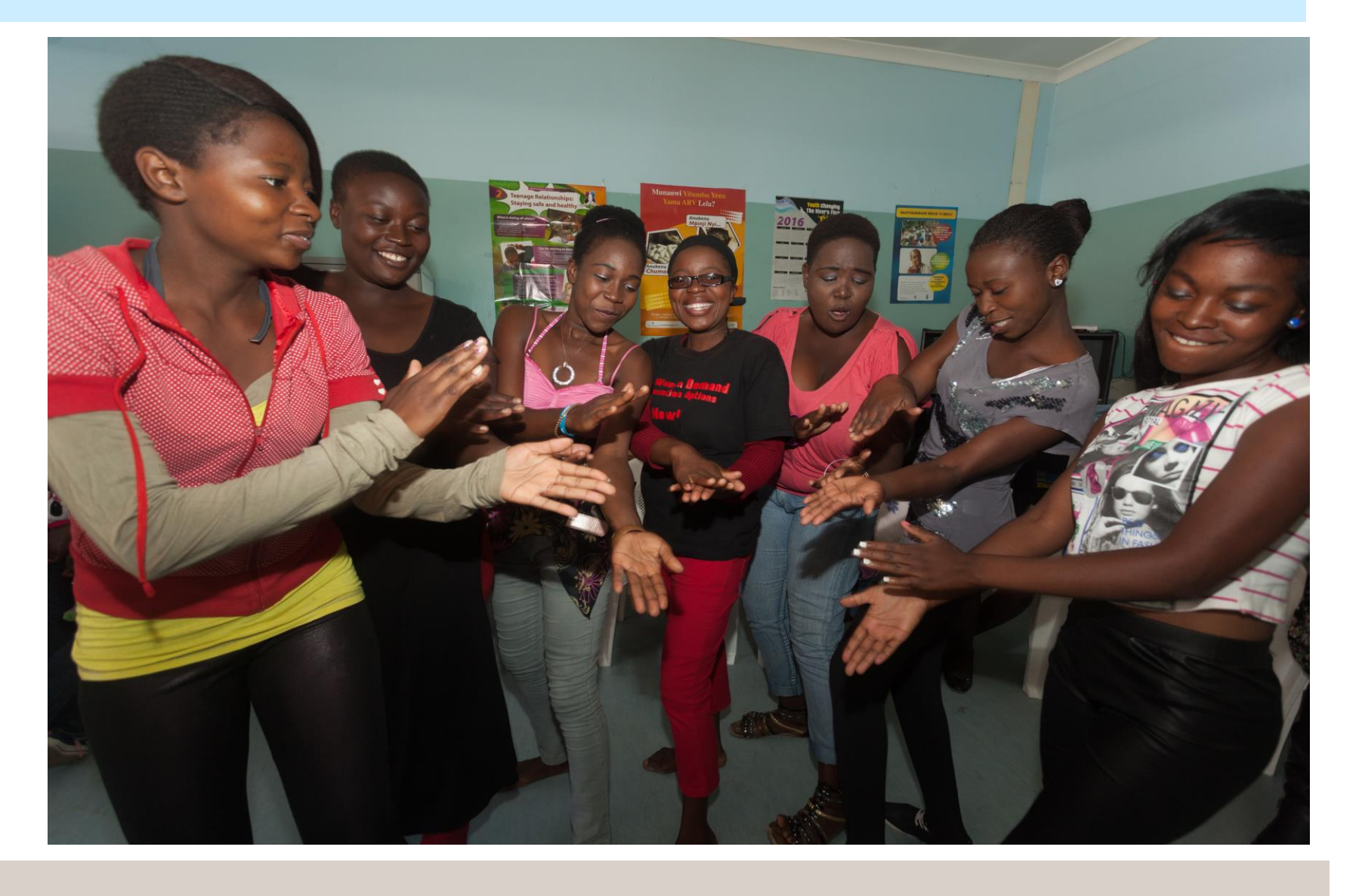
Fig 2: Participants of the SHAZ! HUB youth drop-in center in Zimbabwe learn about ARV-based prevention through participatory life skills sessions.