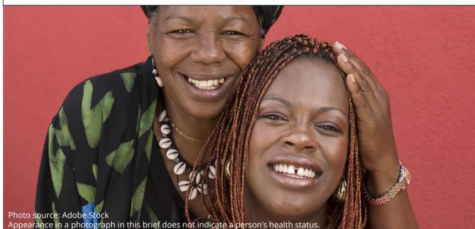
Appearance in a photograph in this brief does not indicate a person's health status.

Dialogue participants assumed that men would have the freedom to use oral PrEP without disclosing it to their wives, just as they secretly use condoms with FSWs and other secondary partners. Artisanal (unskilled) miners, who are often away from home working at the mines, highlighted this similarity between condoms and oral PrEP. “We cannot disclose to our wives that we are taking pills,” said one miner.