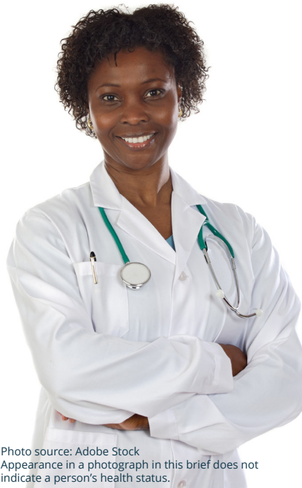
Appearance in a photograph in this brief does not indicate a person's health status.

Participants suggested channels for reaching different audiences with messages about oral PrEP. MSM called for current oral PrEP users to serve as champions. Community members expressed interest in being involved in mobilization activities, PrEP-related dramas, and road shows to provide community-level support for use and adherence. Some adolescents and young women suggested campaigns to educate their mothers about oral PrEP. People living with HIV said they could draw on their experiences with ART to offer oral PrEP users support for adherence to daily pill taking.