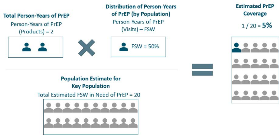
FIGURE 3. Calculating PrEP coverage from Person-Years of PrEP Dispensed and PrEP Visits

Numbers of first-time initiation visits by method can be used to report numbers of clients initiating each method for the first time.