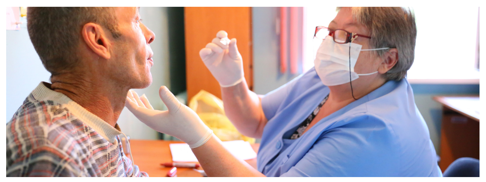
HIV rapid testing, Kazakhstan

Leverage the very best of American ingenuity, including the scientific community, academic institutions, the diaspora, and faith- and community-based organizations and strengthen coordination between PEPFAR and other U.S. government global health and development programs, including for tuberculosis, malaria, sexual and reproductive health and rights, gender equality, LGBTQI+, and human rights.